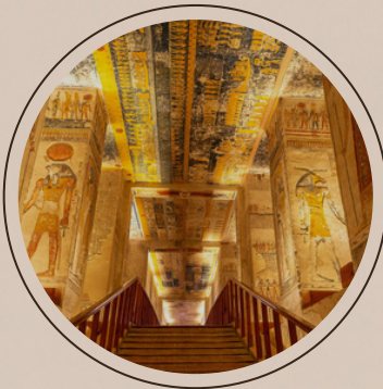
VALLEY OF THE KINGS & QUEENS

The Temple of Edfu is one of the best-preserved temples in Egypt and is dedicated to Horus , the falcon-headed god of protection, kingship, and divine justice.