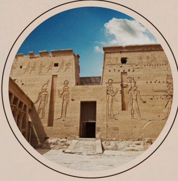
PHILEA AKA ISIS TEMPLE + KOMOMBO + EDFU

The Temple of Philae, dedicated to Isis , the goddess of magic, motherhood, and protection, is one of Egypt's most enchanting temples. This place is a true masterpiece.